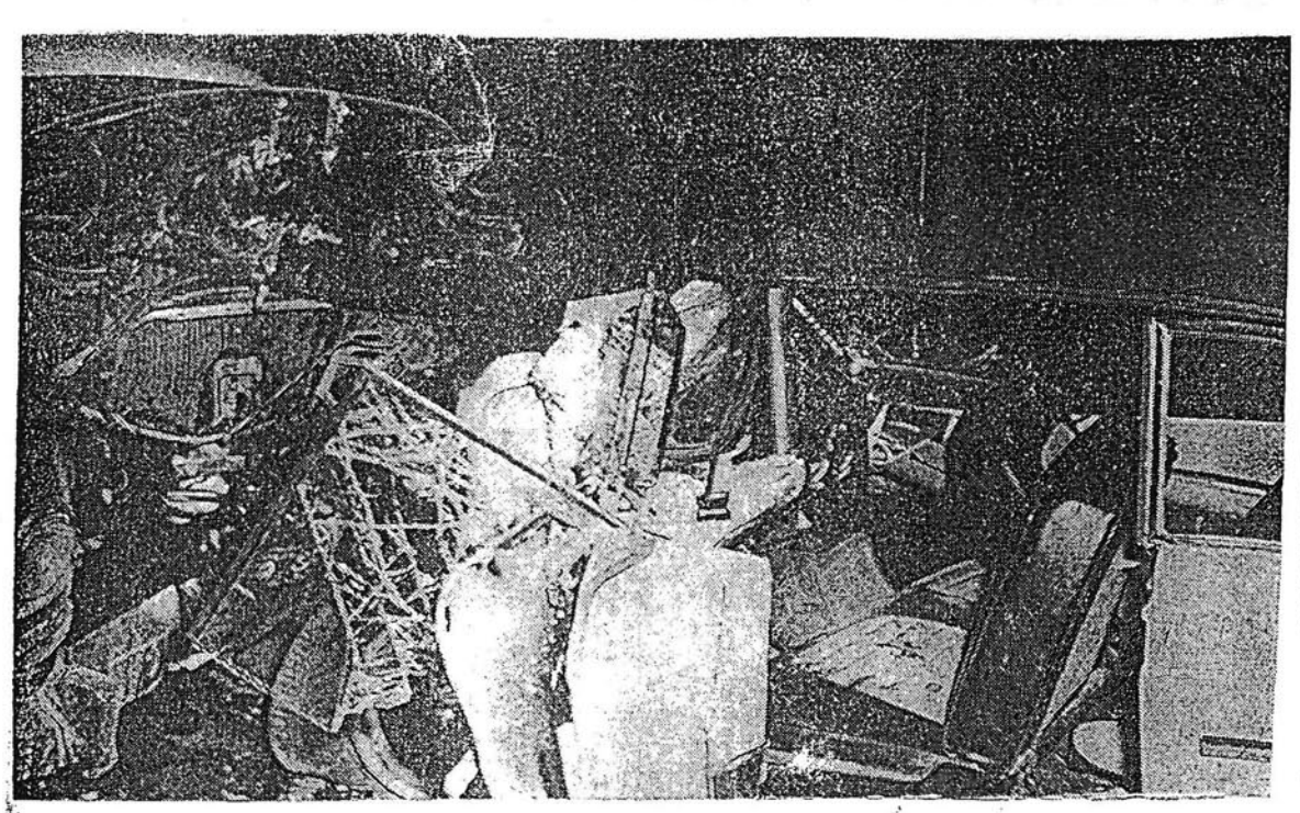
Above is a picture of the wreck of two cars on Bears Den Road Sunday where two teenagers were killed and four others hospitalized, two of them dangerously hurt. It took two wreckers pull the cars apart so they could be moved.